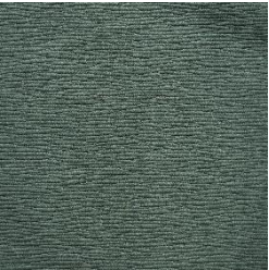
Faro - Basil